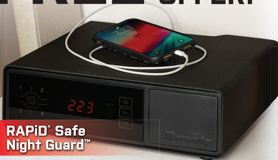
RAPiD® Safe Night Guard™