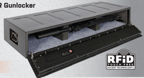
RAPiD® Safe AR Gunlocker